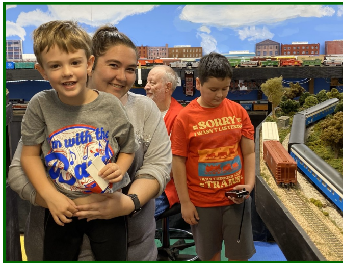
From the KRBN RR Open House, November 23-24 –